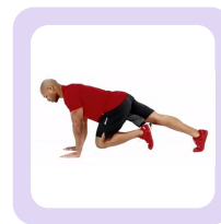
P.2 How to...Do Mountain Climbers