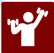
P.1 10-Minute Total-Body Strength Workout

Welcome to your next issue of Training on Board, packed with workout ideas and health tips for seafarers!