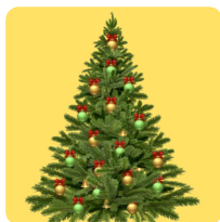
P.2 Festive Fitness